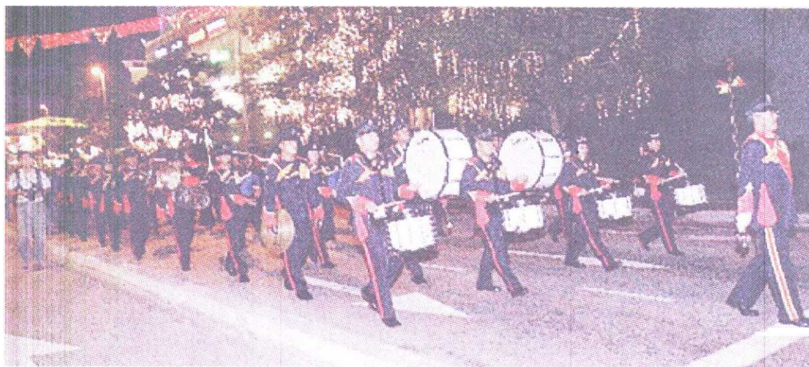
Spectacular sight: Brass band playing with gusto.

This was followed by a special appearance by another mascot – the character Mac Tonight – who had the head of a crescent moon, and wore a dark suit and sunglasses, as well as played the saxophone.