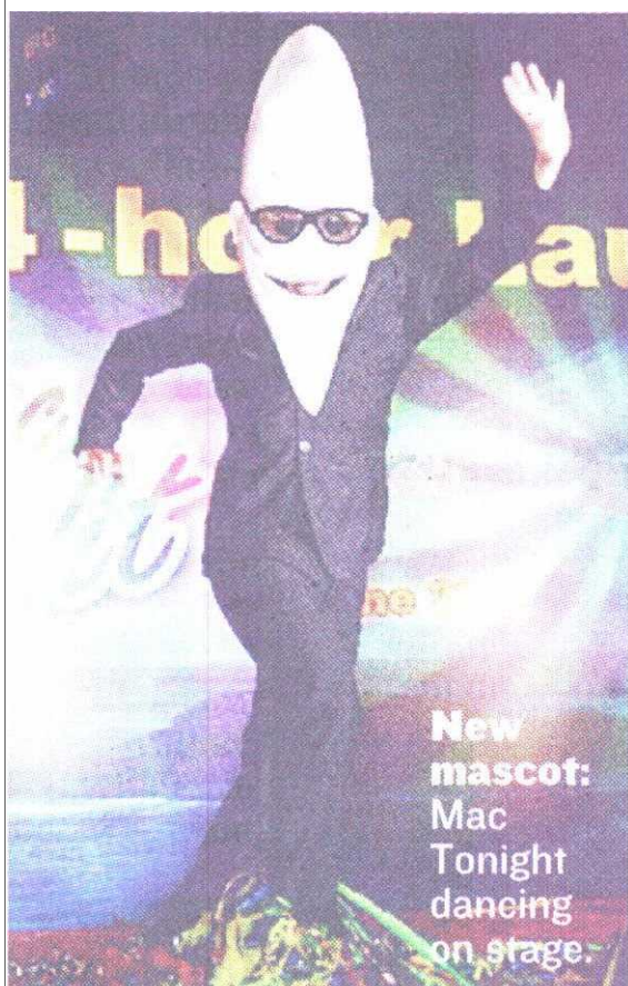
New mascot: Mac Tonight dancing on stage.